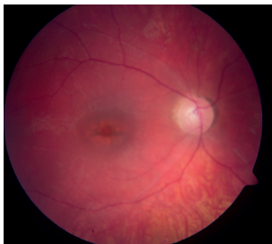
Fig. 1: Fundus of an 8-year old patient with juvenile NCL and macular RPE alteration (so-called bull's eye maculopathy).